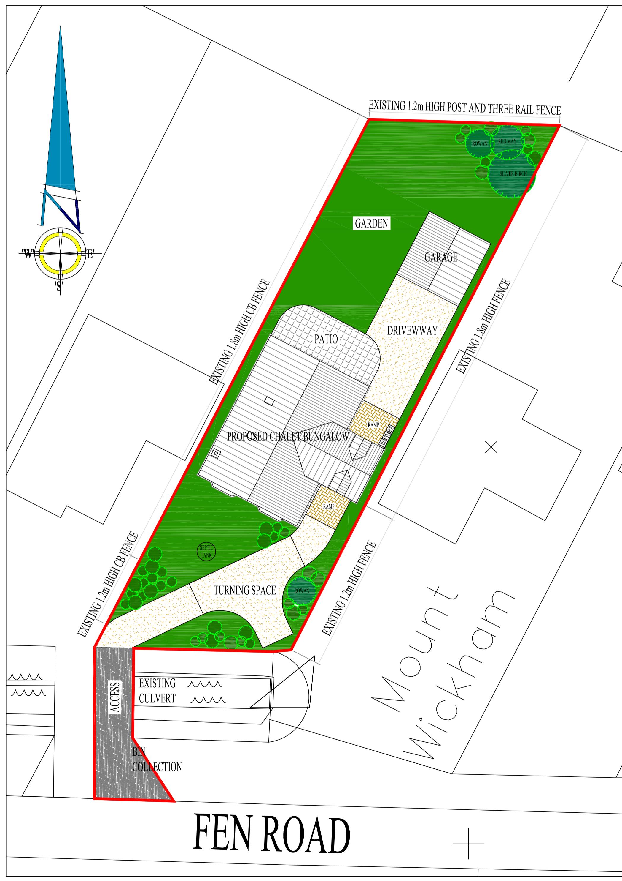
BLOCK PLAN SCALE 1:200